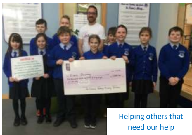
Helping others that need our help